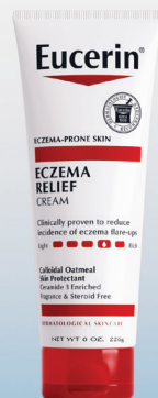
Eucerin Eczema Relief Cream 8 oz UPC: 072140011871

Instantly restores radiance to very dry, dull skin