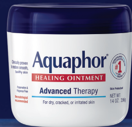
Aquaphor Healing Ointment Skin protectant / 14 oz UPC: 072140636081

There's before, and then there's Aquaphor®