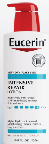
Eucerin Intensive Repair Lotion 16.9 fl oz UPC: 072140110161

Emollient-rich moisturizing formula helps heal and protect extremely dry, sensitive, compromised skin