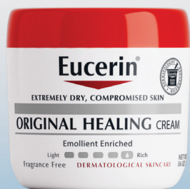
Eucerin Original Healing Cream 16 oz UPC: 07214000219

Emollient-rich moisturizing formula helps heal and protect extremely dry, sensitive, compromised skin