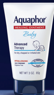
Aquaphor Baby Healing Ointment Skin protectant / 3 oz UPC: 072140633776

One essential solution for many skincare needs