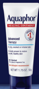
Aquaphor Healing Ointment Skin protectant / 1.75 oz UPC: 072140452315

Clinically proven to restore smooth, healthy skin