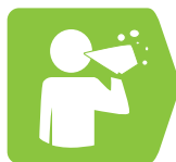
COLD & ALLERGY