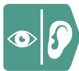
EYE & EAR CARE