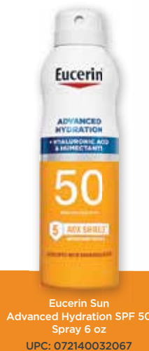
Eucerin Sun Advanced Hydration SPF 50 Spray 6 oz UPC: 072140032067