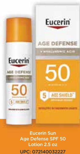
Eucerin Sun Age Defense SPF 50 Lotion 2.5 oz UPC: 072140032227

ORDER FROM YOUR WHOLESALE EUCERINUS.COM QUESTIONS? 1-800-233-2340