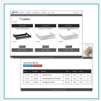
custom reorder websites