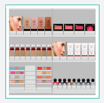
custom product planograms