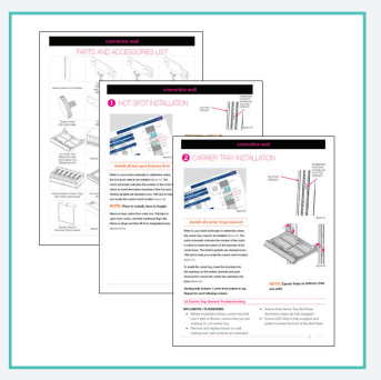
installation guides and videos