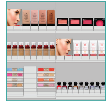
custom product planograms