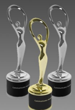
Award-winning Designs and Campaigns

Don't miss your chance to make a GREAT first impression!